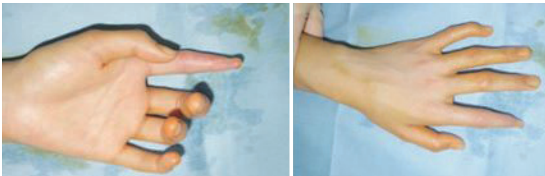
Fig. 2. One-year postoperative photograph of the initial operation of composite graft our description of composite graft indicates full thickness glabrous skin harvested along with a small amount of fat tissue.