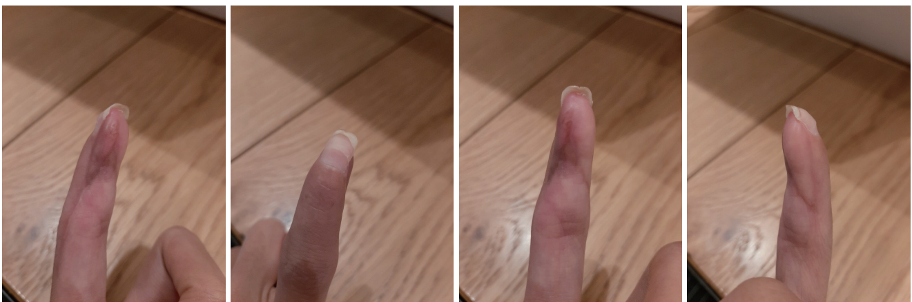
Fig. 5. Five-months postoperative photograph of the reconstructed index finger showing adequate volume and improved motion of proximal interphalangeal joint.