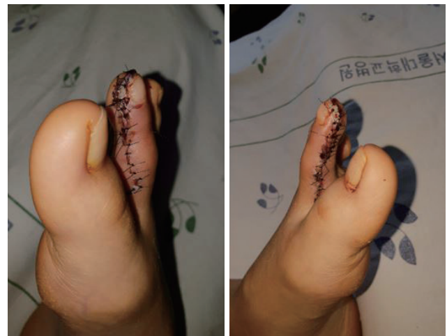
Fig. 3. One week postoperative photograph of donor site of bilateral 2nd toe pulp free flap.

The importance of the finger pulp in daily activities is unquestionable. Hence, a defect in the region often results in functional morbidity that calls for a challenging sensory restoration [10]. The fingertip possesses unique characteristics. A successful reconstruction should achieve adequate skin and soft tissue volume, sufficient resistance against trauma and friction [11]. Skin grafts are avoided because it results abnormal appearance, poor sensation, and splitting in the cold of winter [2]. Soft tissue restoration is important because it does not regenerate well, while the skin regenerates well. Tissue coverage using local flap should obtain complete tension-free closure to