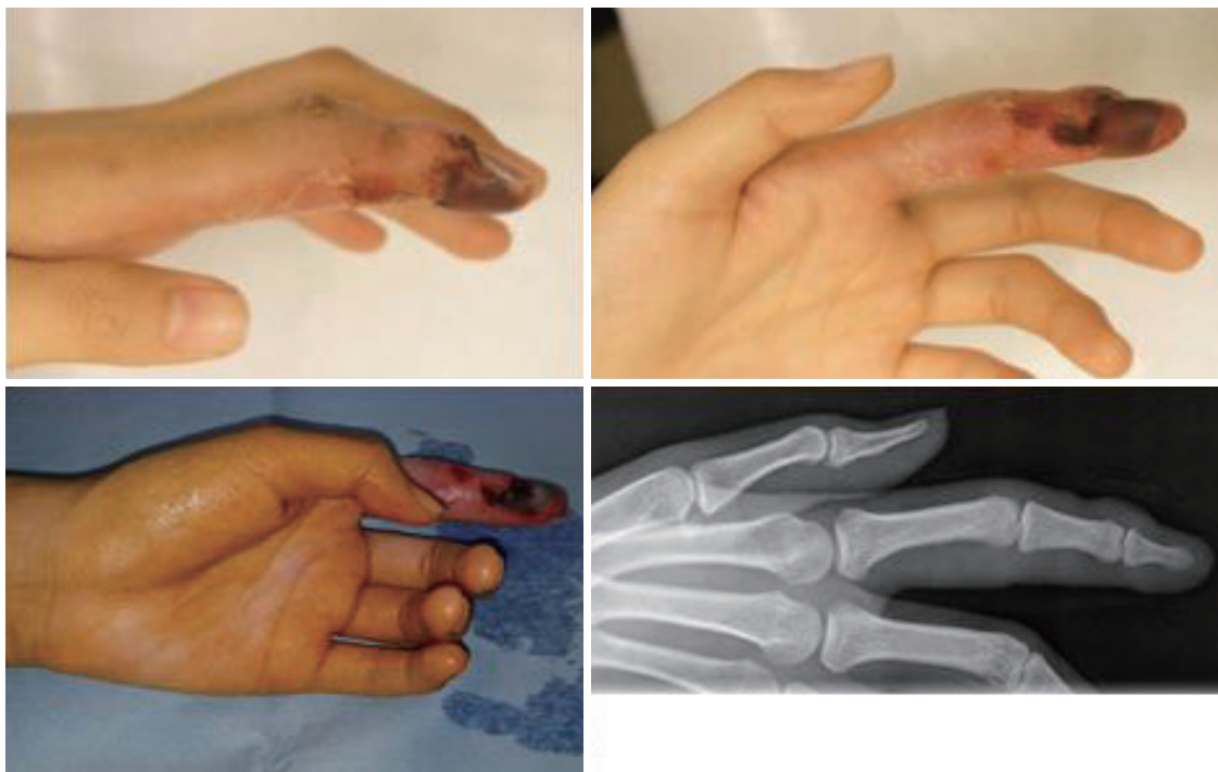
Fig. 1. Gross photograph and X-ray of the initial visit.

Under local anesthesia, complete debridement of necrotic tissue was done until fresh blood was visible. Full thickness skin graft was harvested from the left hypothermic area and grafted over the remaining pulp tissue. This was 2 weeks after the initial incident. During the follow-up period, all the infection and inflammation sign was completely removed, but the finger showed severe atrophic change (Fig. 2). At 1 year postoperative follow up, the patient wanted to improve the shape of it for her job working, like playing the piano as a kindergarten teacher. Therefore, finger-tip reconstruction using free flap was planned. Under general anesthesia, incision was made on the left 2nd finger longitudinally on both ulnar and radial sides for pedicle exposure. Bilateral toe pulp flap was harvested from both right and left 2nd toe radial sides. Dissection was done above the tendon sheath, and the digital artery and nerves were identified. The donor wound was closed primarily (Fig. 3). Arterial and nerve anastomosis was done under the microscope using 10-0 nylon. Bilateral digital arteries and bilateral digital nerves were anastomosed as all an end to end. Venous anastomosis was not performed. Due to the small volume of